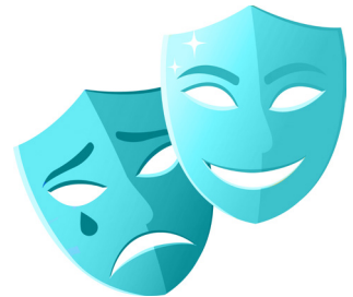
Amelia G. Tapper Center For The Arts